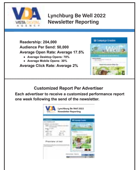
Sample Newsletter Report